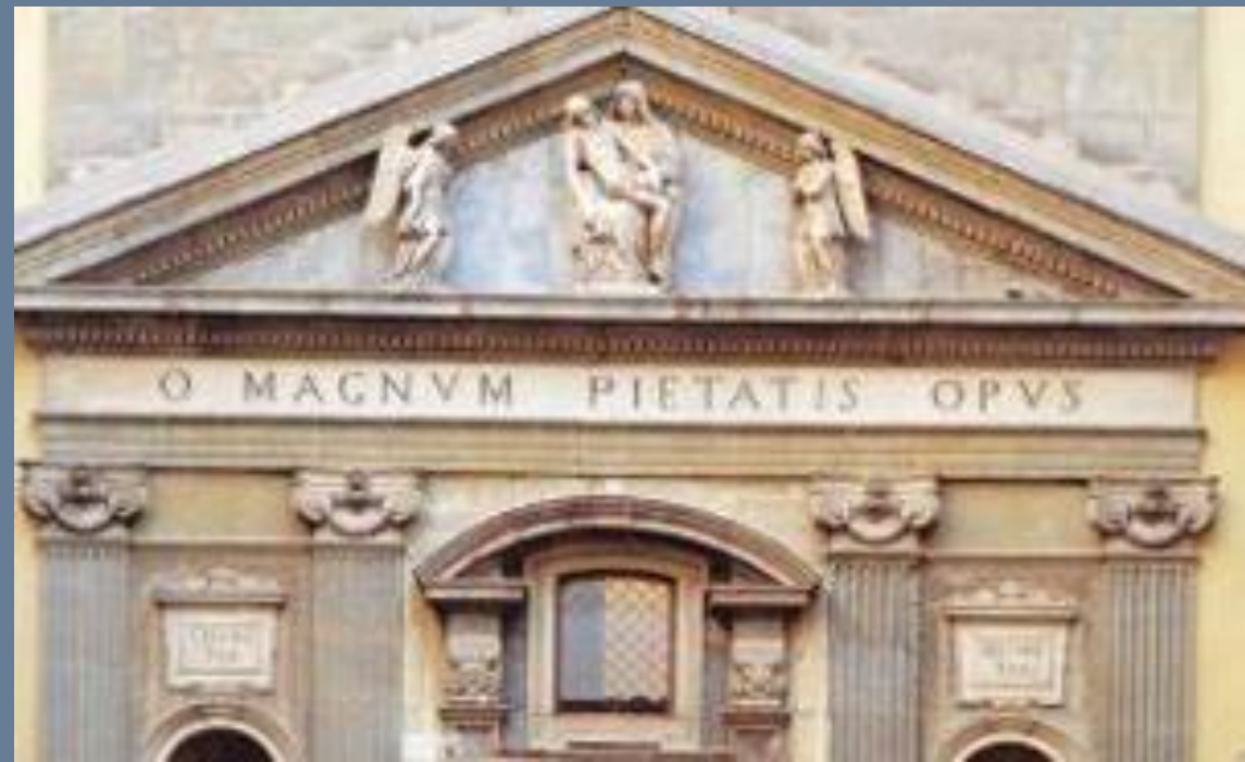
Monte di Pietà, Naples (1539)