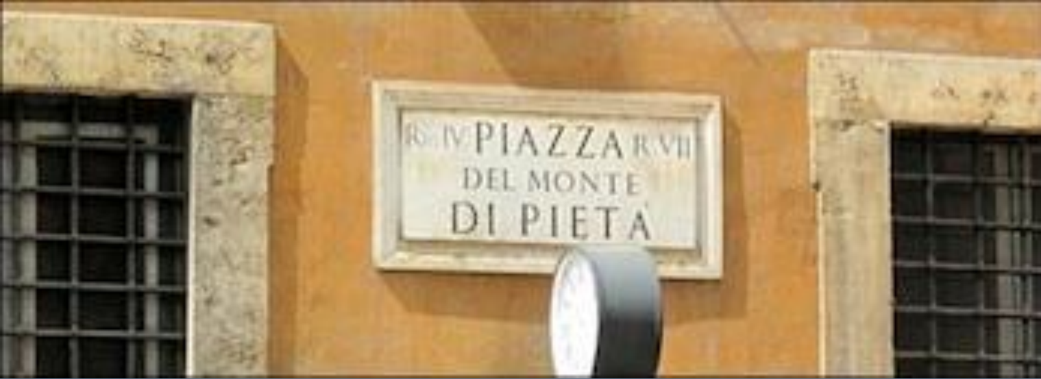
Monte di Pietà, Perugia (1460)