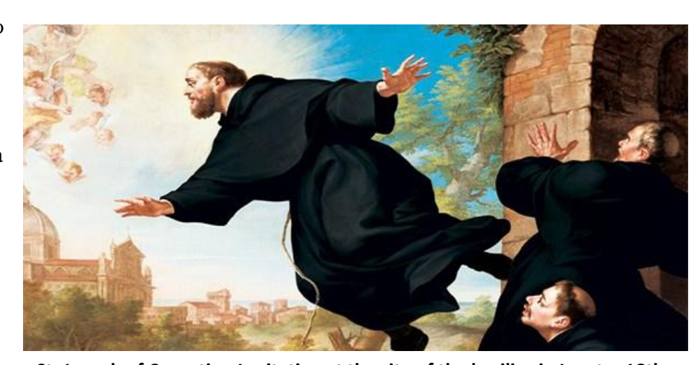
St. Joseph of Cupertino Levitating at the site of the basilica in Loreto; 18th century painting by Ludovico Mazzanti (public domain).

I am fortunate to live in Loreto, not only for the Marian spirituality of the Holy House of Mary in the Basilica of the Holy House, but also for the numerous saints in the region. Just 10 miles away is the picturesque hill town of Osimo, famed not only for its architecture and food, but for the