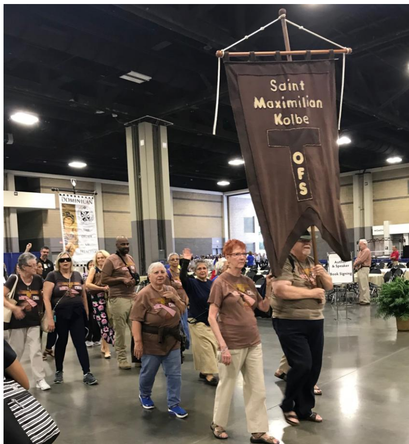
Members of St. Maximilian Kolbe Fraternity marched in the procession during the Diocese of Charlotte, N.C.'s Eucharistic Congress in September.