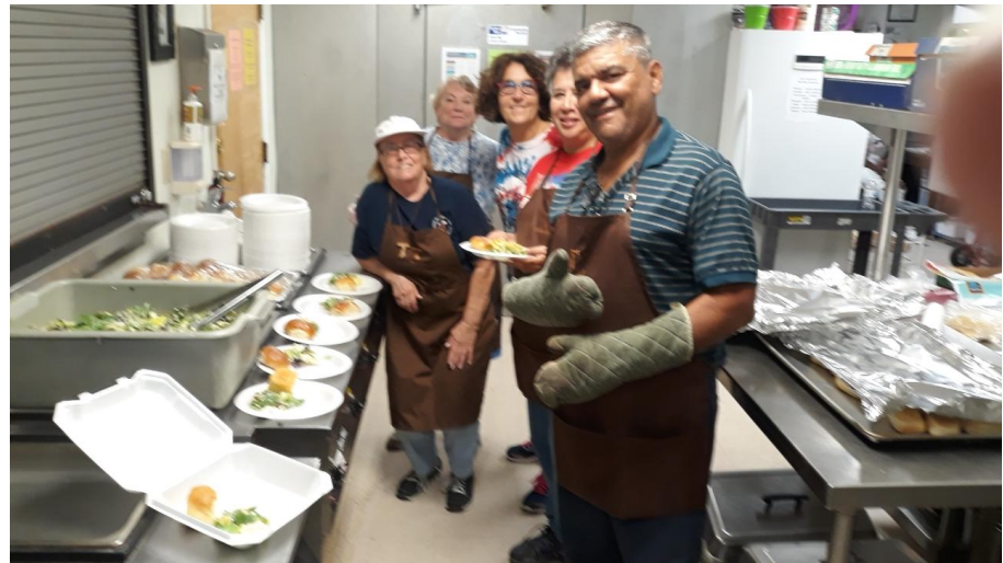
Members of Blessed John Duns Scotus Fraternity prepare meals for New Directions and Homeless.