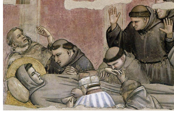
The Ascension of St. Francis of Assisi. Painting by Giotto/public domain

"Praised be You, my Lord, through our Sister Bodily Death, from whom no one living can escape. Woe to those who die in mortal sin. Blessed are those whom death will find in Your most holy will, for the second death shall do them no harm." Canticle of the Creatures by St. Francis of Assisi