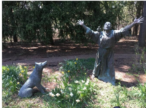
Sculpture of Francis and the Wolf at the National Shrine of St. Maximilian Kolbe at Marytown in Libertyville, Ill.