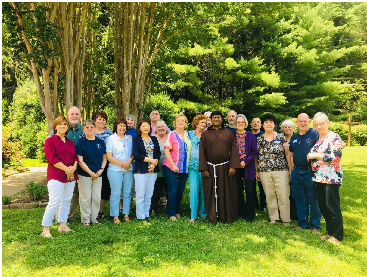
St. Francis of the Hills Fraternity and members of St. Clare Fraternity, share a retreat day at Sacred Heart Church in Brevard, N.C.