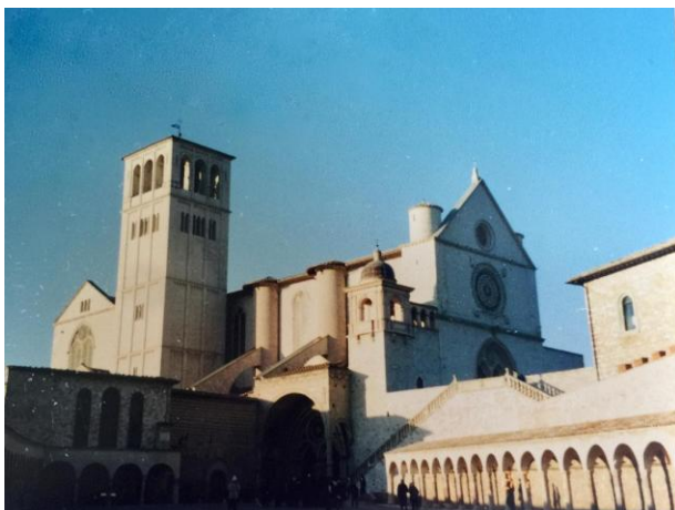
The Basilica of St. Francis, Assisi, Italy.