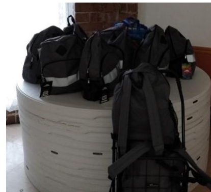
Blessing backpacks filled with love and prayer by the Fraternity of Brother Francis, Newton, NC.

Mindful that our Lord came into this world as a frail and helpless newborn infant, as an apostolic activity we provided infant items and packed 10 backpacks that were donated to the Ashe Pregnancy Care Center to help infants and families in need. With a spirit of communion we offered prayers for those who would be receiving the back packs.