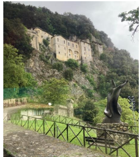
A rainy Greccio

As I prayed for our Franciscan family, I felt the grace of the Holy Spirit and the presence of our Seraphic Father Francis in that wonderfully sacred space. And as we celebrate the 800 th anniversary of that first Christmas scene, we also celebrate the spirit of Francis as he made present the Incarnation of our loving God, who humbled himself to become one of us for his great love of us.