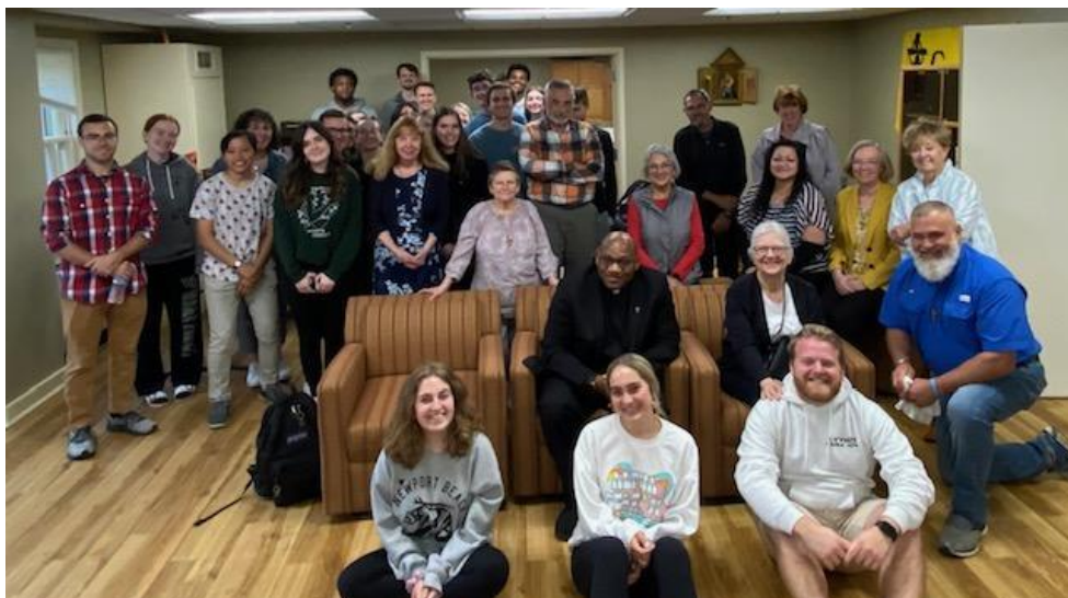
Fraternity members at the Fraternity of St. Clare plan regular meals and fellowship with students at Wake Forest University in North Carolina as a way of sharing Franciscan spirituality.

The Fraternity of St. Clare in Winston Salem, North Carolina will continue to nurture the relationship with Wake Forest University Catholic Campus Ministries next academic year when they welcome the students back to campus Sept. 6 and towards the end of the fall semester on Dec. 6.