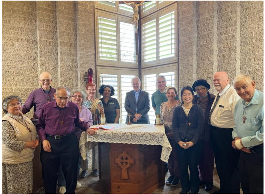
Members of St. Maximilian Kolbe Fraternity in Charlotte, NC, gather to grow in the love of Christ and the continuous conversion of mind and heart.