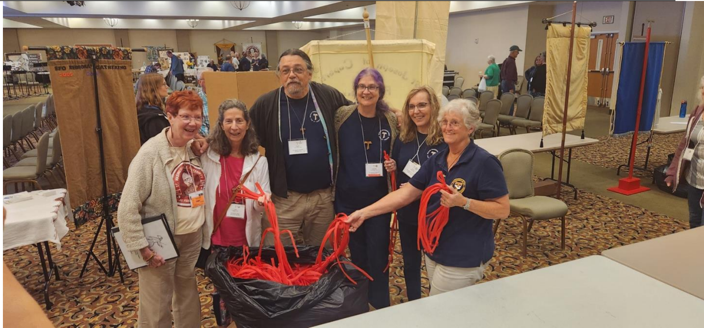
Five-thousand gleaning bags were delivered to the Society of St. Andrew collection center in Durham for use in late summer gleaning.